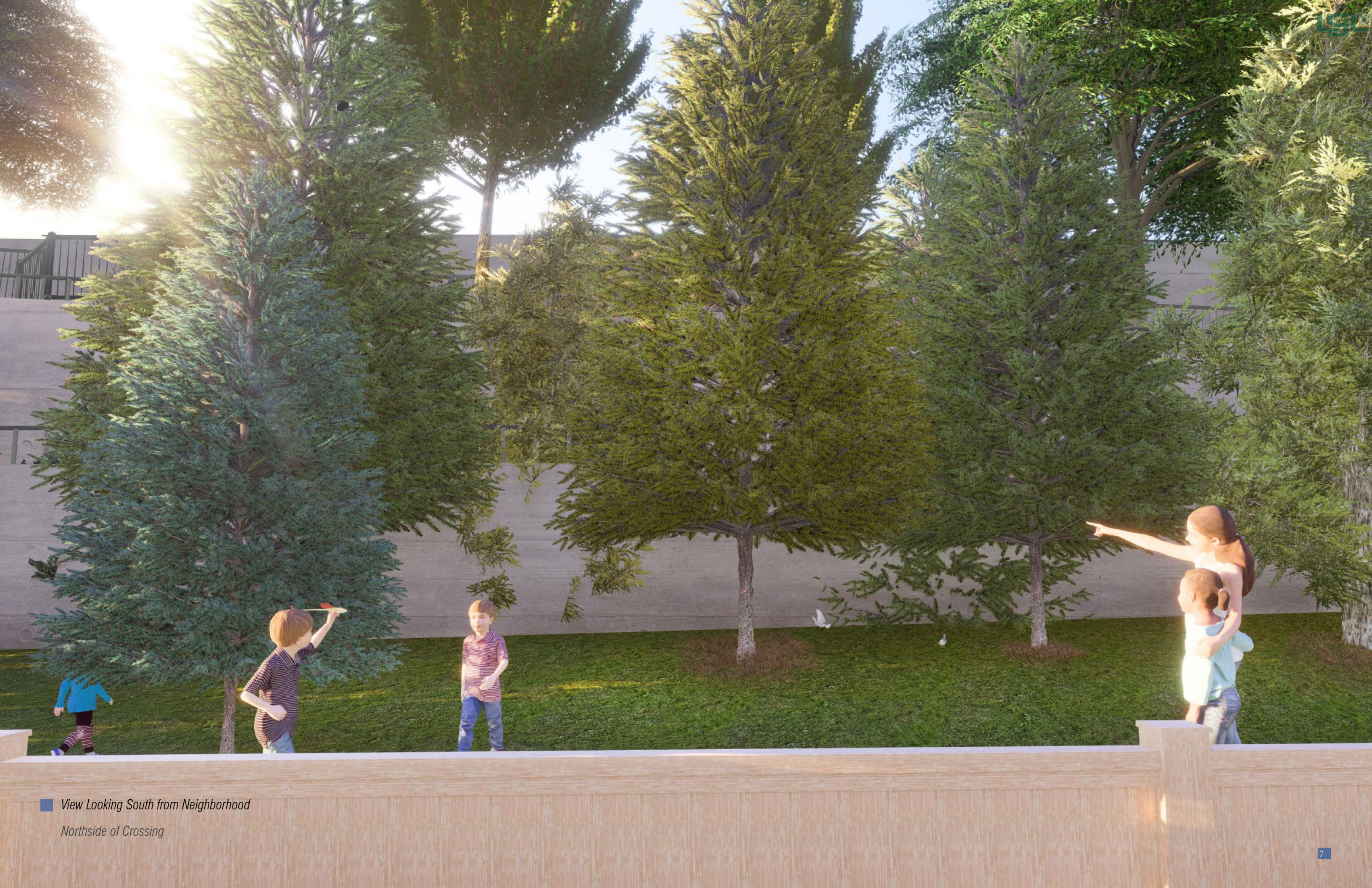
■ View Looking South from Neighborhood Northside of Crossing